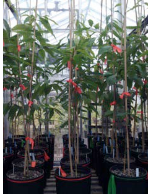
Figure 1. Established BC3F1 seedlings prior to Phytophthora cinnamomi inoculation.

Chestnut seedlings were obtained in early April 2011, and planted into 12 L nursery containers. Soil substrate consisted of three treatments of a 1:1:1 mixture of peat, perlite, and sand, with pH levels of 4.0, 5.5, or 7.0. Substrate pH treatments were established through additions of \text{CaCO}_3 , and were carefully monitored throughout the growing season. Prior to container planting, seedlings were presorted to ensure damaged and/or too small and too large seedlings were eliminated from the sample, in an effort to reduce potential confounding factors. Half of all seedlings were inoculated with Pisolithus tinctorius basidiospores at the time of planting. All containers were then be placed in the Lilly greenhouse facilities (Purdue University, West Lafayette, Indiana, USA), and grown under ambient greenhouse conditions for one growing season. Pots were monitored daily, and watered regularly throughout the growing season. All laboratory work was carried out in the Purdue Plant and Pest Diagnostic Laboratory located in the Lilly Hall of Life Sciences (Purdue University, West Lafayette, Indiana, USA).