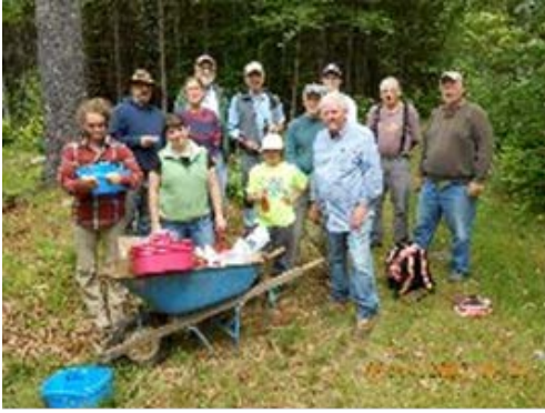
Volunteers at a tree inoculation work party in July, 2013