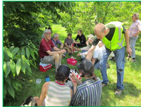
Volunteers rest and enjoy watermelon after inoculating trees in the Veazie orchard.