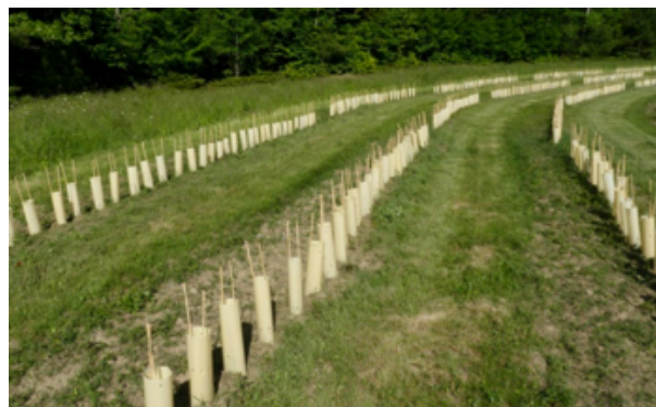
Figure 1. Newly planted seed orchard in Maine.

A seed orchard planting will be at least one acre, which consists of one block. Each block of seed orchard contains 20 plots, each one representing a different American chestnut parent from CT. Within each plot, 150 trees are planted on tight spacing (Figure 2). With 20 of these plots, at least 3,000 nuts will be planted in a block over the duration of the planting phase of the orchard. Once all the trees in a given plot are about five years old, they will be challenged with the blight fungus. The best tree in each plot will be selected for breeding within the seed orchard, all others will be removed. This means that of the 3,000 nuts planted in a block, only 20 trees will remain after challenging with the blight fungus and making breeding selections. This process will take at least 10 years and, once completed, the orchard will be used for nut production to facilitate forest testing and reintroduction.