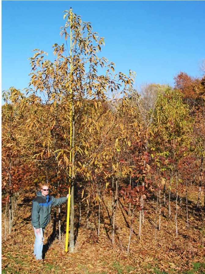
Fig. 3. Typical American chestnut 8 years following direct seeding.

species. This was probably partly a function of the dominance of American chestnut in this mixed planting, as much of the deviation in straightness of all trees appeared to be associated with growth toward canopy light patches. Maintenance of this relatively straighter form in mixed plantings, particularly when combined with exceptionally rapid growth, may make American chestnut a highly desirable species choice for timber production.